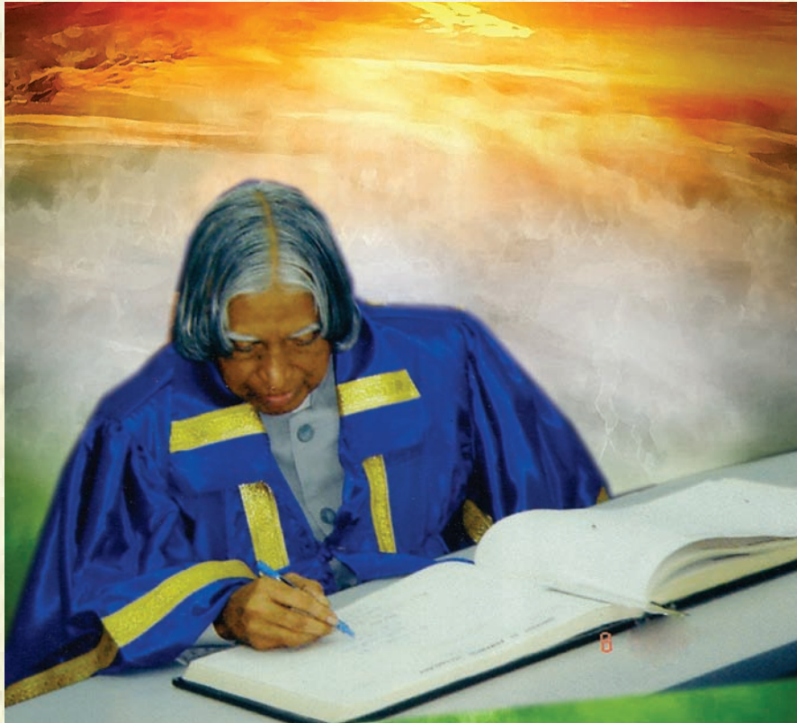
Dr. A. P. J. Abdul Kalam, signing the roll of honour at DIAT.

"Dream is not that which you see while sleeping, it is something that does not let you sleep."