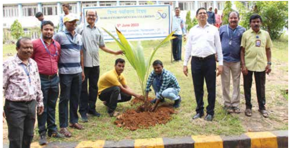
Plantation Drive at the NSTL campus

On the occasion of WED-2023 on 5 June 2023, Naval Science & Technological Laboratory (NSTL), Visakhapatnam fraternity along with Mahila Kalyan Members (MKM) members organised a painting competition for MKM members with the theme 'Solution