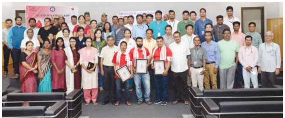
Blood Donors during the Blood Donation Camp at DRL, Tezpur

World Blood Donor Day was observed on 14 June 2023 at Defence Research Laboratory (DRL), Tezpur, in association with the Blood Bank, Kanaklata Civil Hospital, Tezpur, by organising a Blood Donation Camp as part of the 'Raktdaan Amrit Mahotsav'. A large number of volunteers participated in the camp, and 26 units of blood was collected. Blood Bank, Kanaklata Civil Hospital acknowledged the DRL for organising the camp to promote the spirit of voluntary blood donation and helping meet the constant demand for safe blood by providing citation to the institute and a Letter of Appreciation to the donors.