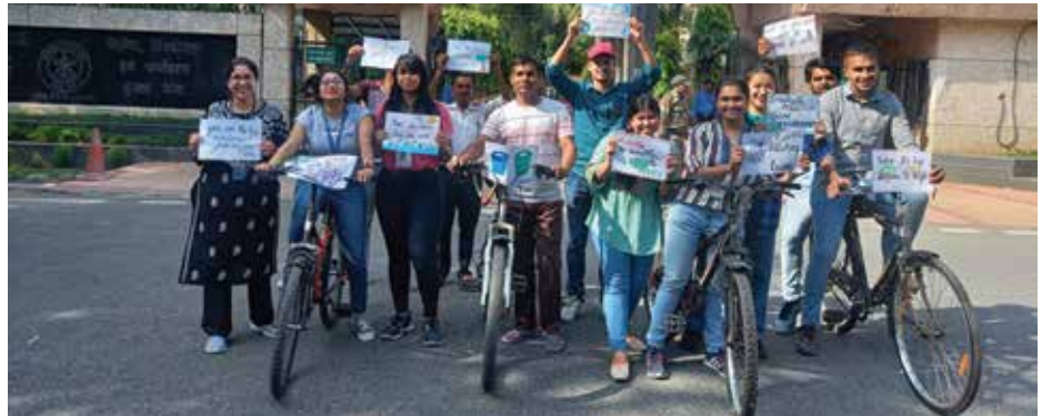
Bicycle Rally: 'Solution for Pollution' organised in the Campus of CFEES

Centre for Fire, Explosive & Environment Safety (CFEES), Delhi celebrated World Environment Day (WED)-2023 with a series of events. A 'Mass Awareness Programme for Mission LiFE (Lifestyle for Environment)' was organised. LiFE Centres were set up for collecting old clothes, books, & utensils. A Bicycle Rally was conducted to promote 'LiFE' with a theme of 'Solution for Pollution'.