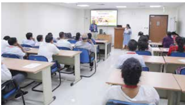
World Environment Day 2023 celebrations at ISSA

Institute for Systems Studies & Analyses (ISSA), Delhi