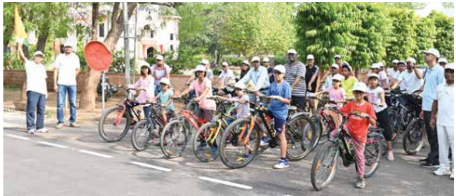
Bicycle Rally organised in DLJ residential area to promote LiFE objectives

Under the mission LiFE, one-week environmental protection drive was celebrated at Defence Laboratory, Jodhpur (DLJ) during 1-5 June 2023. A LiFE Pledge was administered to all DLJ employees by the Director, DLJ. A Bicycle Rally was organised in residential area to promote LiFE objectives among DLJ employees along with families and conservancy staff. Special campaign for plastic waste collection was taken up in the DLJ Campus. About 20 kg of plastic waste was collected and disposed.