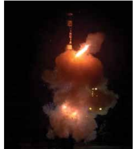
Successful training launch of Agni-1 Ballistic Missile

A successful training launch of a Medium-Range Ballistic Missile, Agni-1 was also carried out by the SFC from APJ Abdul Kalam Island, Odisha on 1 June 2023. The missile is a proven system, capable of striking targets with a very high degree of precision. The user training launch successfully validated all operational and technical parameters of the missile.