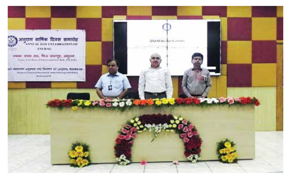
Raising Day celebration at ANURAG

commendable performances for the year 2018. Awards for best innovative ideas were also distributed on this occasion. Mementos were distributed to employees who completed 20 and 25 years of service.