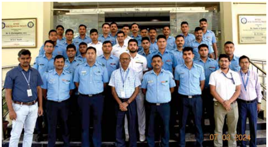
Industrial visit and demonstration at MTRDC, Bengaluru