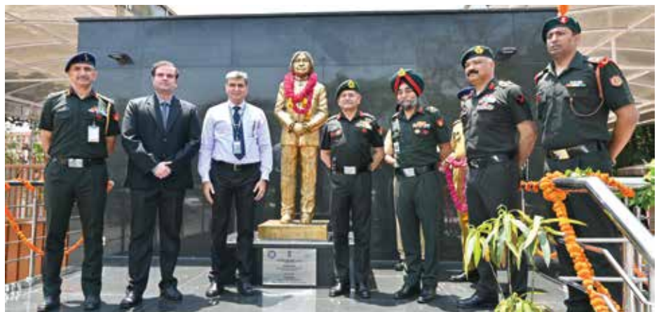
Lt Gen Upendra Dwivedi, during his visit at DMSRDE, Kanpur