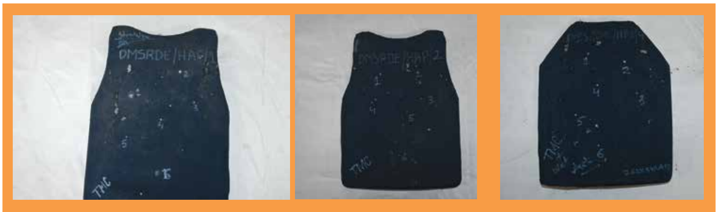
Tested Hard Armour Panels

ICW Hard Armour Panel (HAP) and standalone HAP is less than 40 kg/m 2 and 43 kg/m 2 , respectively.