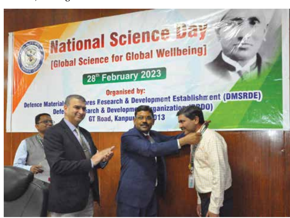
National Science Day Celebrations at DMSRDE, Kanpur