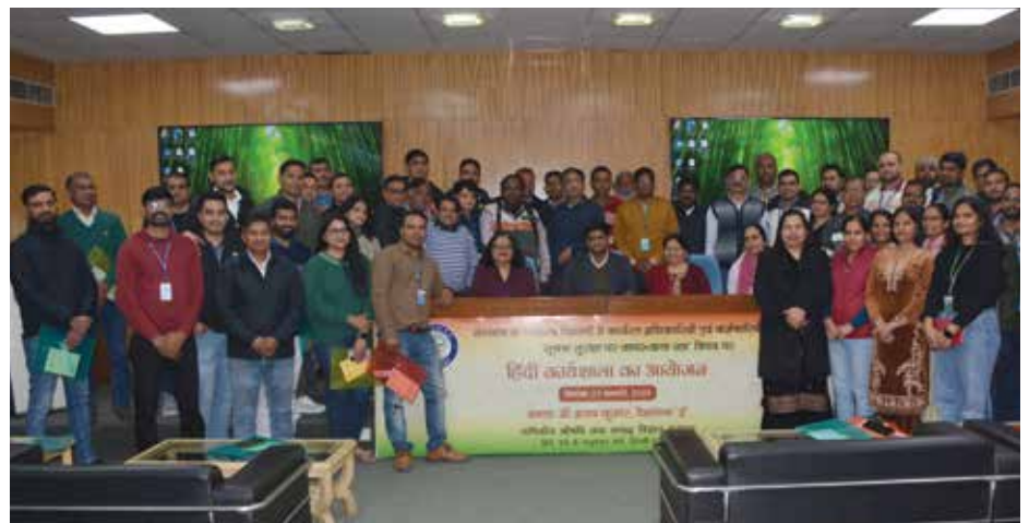
Hindi workshop at INMAS, Delhi