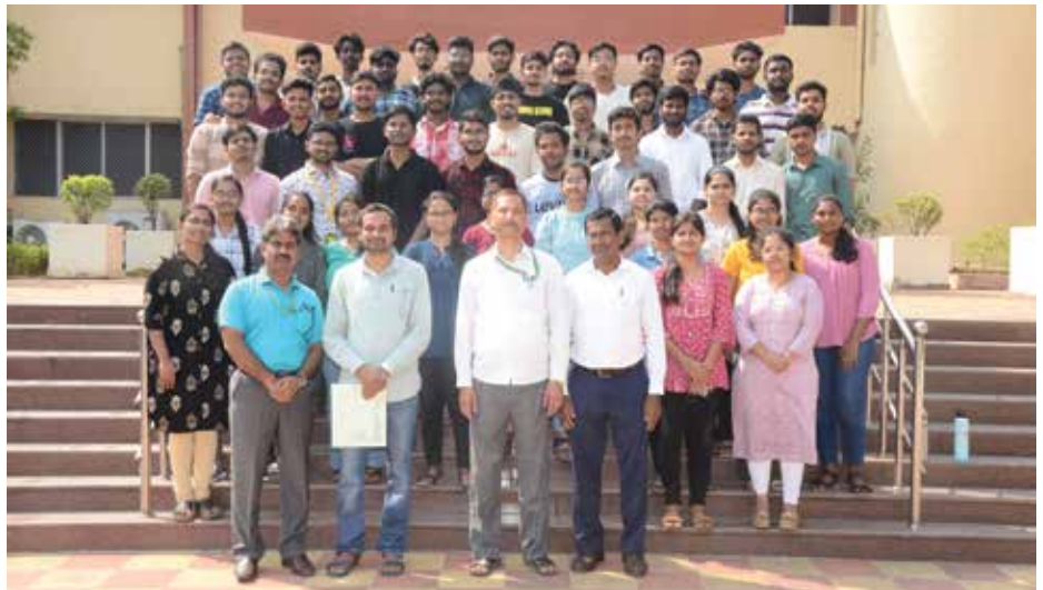
Students from NIT Warangal at DMRL, Hyderabad