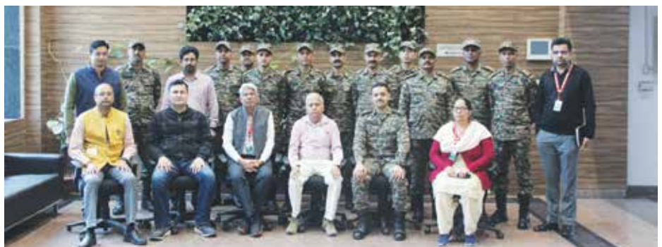
Students from Centre for Automated Military Survey at ISSA, Delhi