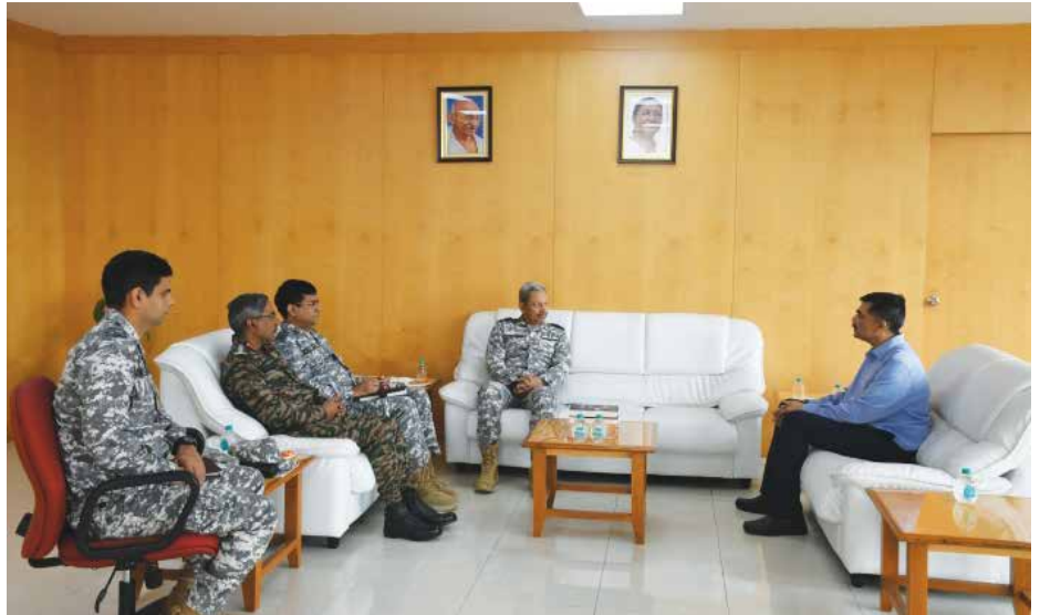
General Anil Chauhan in discussion at CAIR, Bengaluru