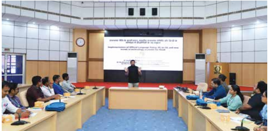
Hindi workshop at NPOL, Kochi

Naval Physical & Oceanographic Laboratory (NPOL), Kochi, conducted the fourth Hindi workshop of the financial year 2024–25 on March 3, 2025,