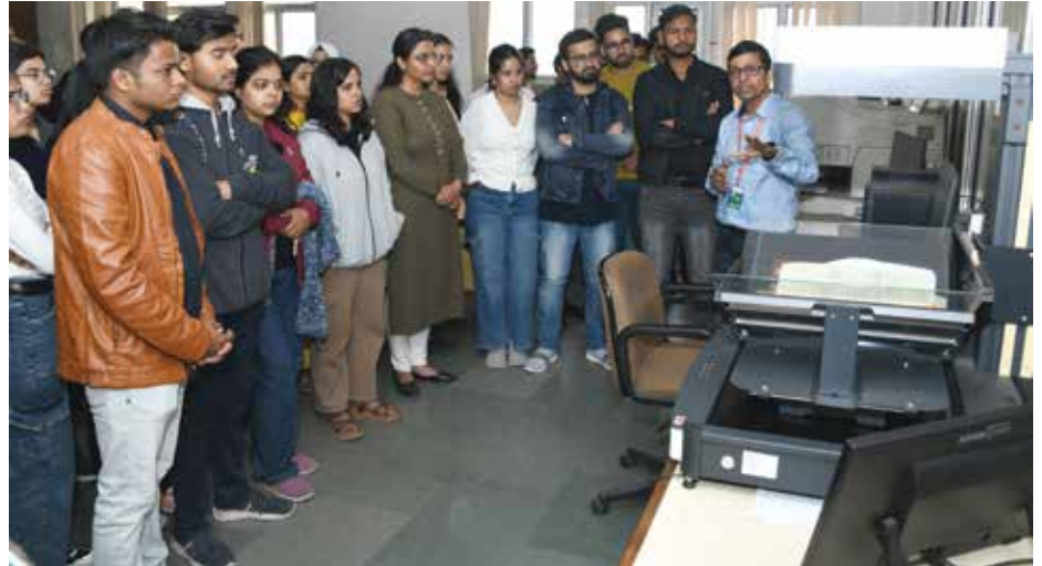
Students from University of Delhi at DESIDOC, Delhi