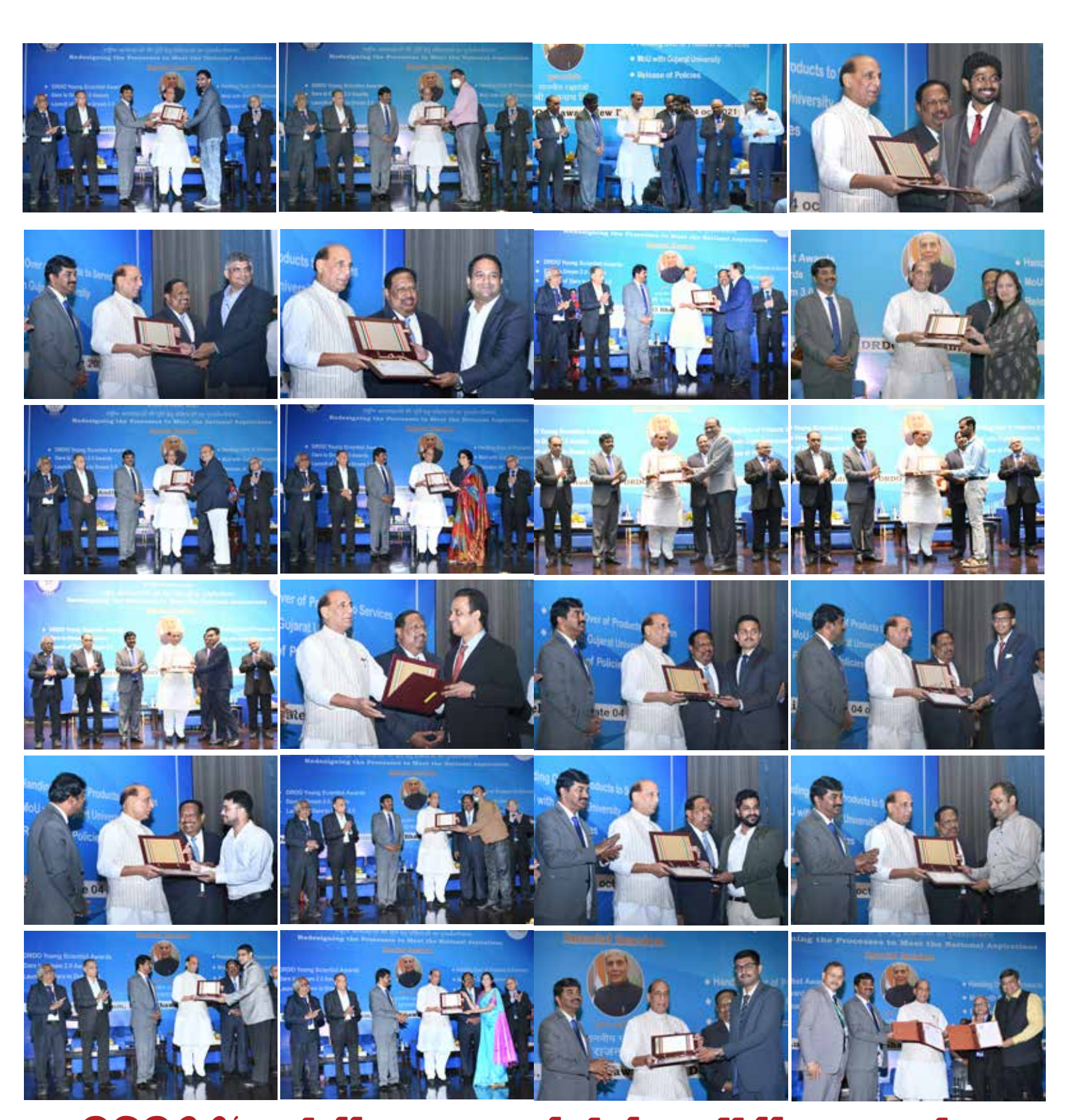
DRDC Newsletter congratulates all the awardees.