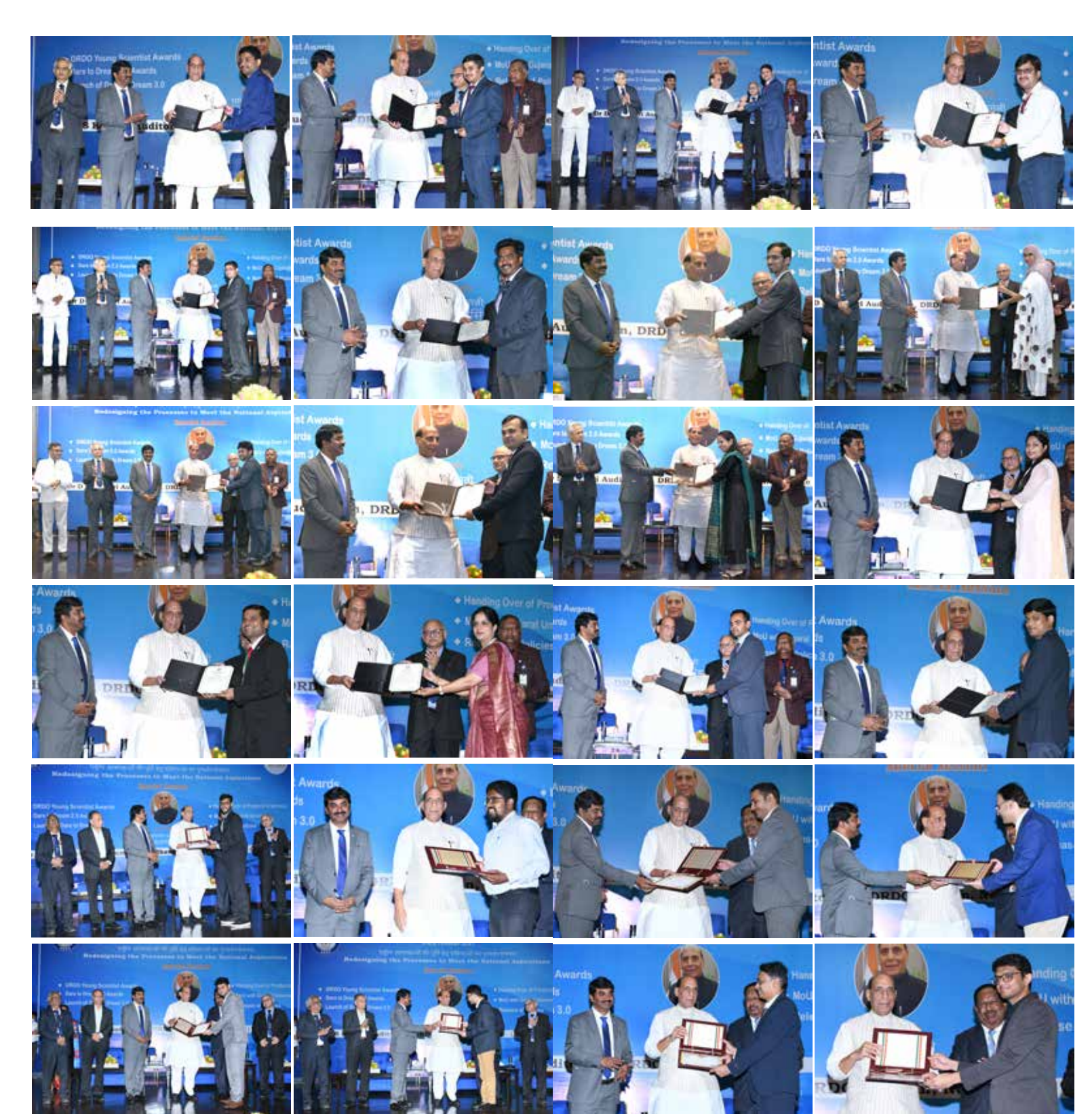
DRDC Newsletter congratulates all the awardees.