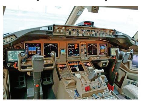
Figure 1.1. Cockpit of Boeing 777.

Another area of major impact of modern avionics is the cockpit and pilot vehicle interface. In earlier aircrafts, there were a large number of mechanical and electromechanical instruments in the cockpit which were difficult to read which increased the pilot's workload. In modern avionics systems, information from all aircraft systems and sensors are available in real time. This has enabled the introduction of 'Glass Cockpit' with programmable large LCD multi function displays which provide the pilot with any information he needs at the touch of a button/icon. Electronic Flight Instrumentation System (EFIS) increases the situation awareness (both external and internal) of the pilot and reduces his workload. In fact integrated avionics system with glass cockpit and increased automation has enabled the reduction of crew in the cockpit of large long distance passenger aircrafts from four to two. Avionics enables extensive automation of many of the pilot's functions and improves the safety of the aircraft by giving early warning of faults in any system or navigation errors or adverse weather conditions. A typical glass cockpit of a civil aircraft (Boeing 777) is shown in Fig. 1.1.