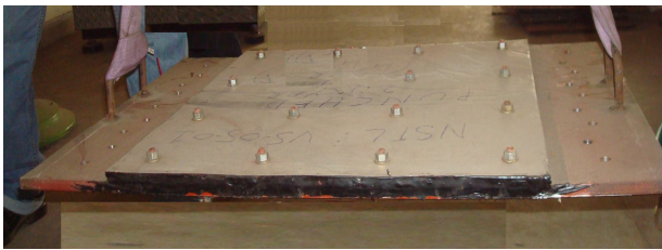
3 layer VDC applied on base structure

Vibro Damping Coating (VDC) is a multilayer sandwich structure for use in submarine decks and engine rooms for suppressing the structural vibration arising from the operation of onboard machinery. The VDC is fabricated by adhering multiple layers (typically 3 layer) of rubber sheet (IRP1074) and sandwiching the multilayer rubber structure between base structure and constraining layer. The top constraining layer is applied onto the rubber layer by adhesive and the sandwich structure is bonded to the base by mechanical bolting.