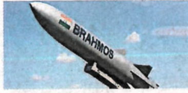
ब्रह्मोस मिसाइल •

कुछ दिनों में होने वाली रक्षा मंत्रालय की उच्च स्तरीय बैठक में