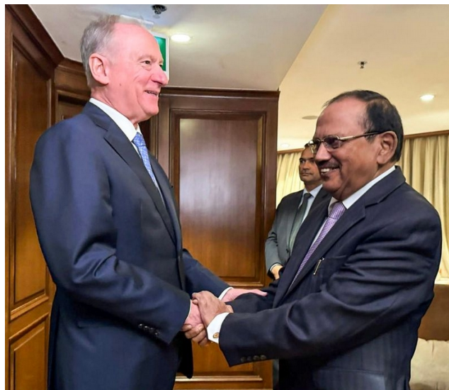
Ajit Doval welcomes Nikolay Patrushev in New Delhi