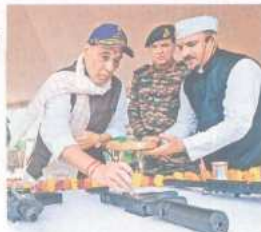
भुज में गुरुवार को विजयदशमी के अवसर पर शस्त्र पूजन करते रक्षा मंत्री राजनाथ सिंह ● 03

पाकिस्तान को याद रखना चाहिए कि कराची का एक रास्ता सर क्रीक से भी गुजरता है। - राजनाथ सिंह, रक्षा मंत्री