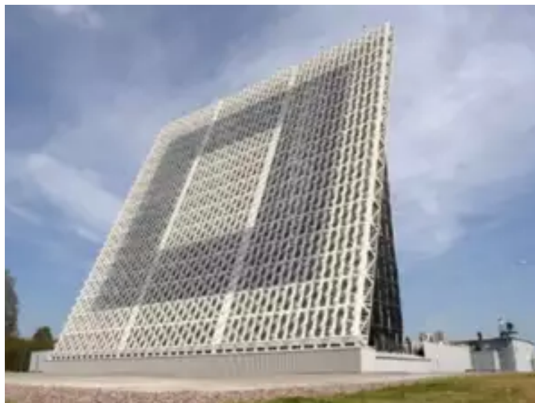
Voronezh radar system

The centrepiece of the proposed deal is the Voronezh radar system, developed by Russia's Almaz-Antey Corporation, known for its expertise in missile systems and radar technology. With a vertical range exceeding 8,000 kilometres and a horizontal reach of over 6,000 kilometres, the radar can detect and track multiple threats, including ballistic missiles, stealth aircraft, fighter jets, and intercontinental ballistic missiles (ICBMs).