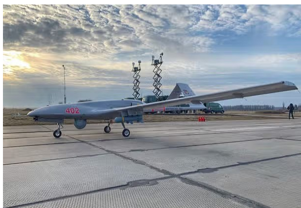
Turkish Bayraktar drone (Representative Image)

The drones have been observed carrying out reconnaissance missions within Bangladeshi airspace, particularly in regions bordering India, over the past few months.