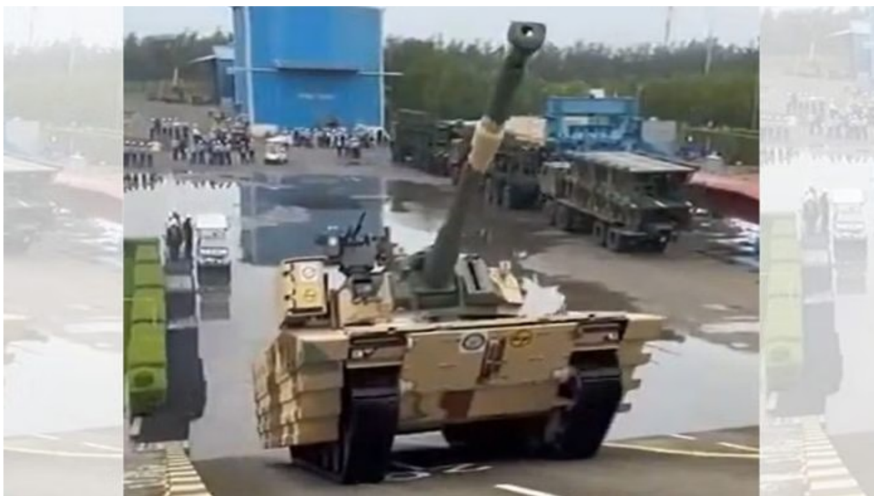
Light tank Zorawar developed jointly by DRDO and L&T

The initial demand of the Army is roughly 350 light tanks to take on the Chinese in the mountainous borders.