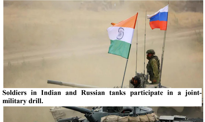
Soldiers in Indian and Russian tanks participate in a joint-military drill.

Given this geo-political scenario, any hypothetical clash with Pakistan or China, or both together, will see Delhi look towards Moscow, whether it's for military resupplies or spares.