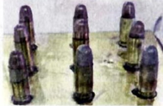
फ्रेंजीबिल बुलेट • जागरण