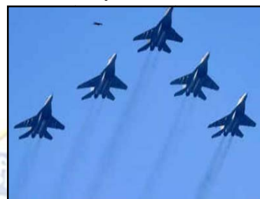
Government approves purchase of fighter jets, missile systems, weapons worth Rs 38,900 crore

https://timesofindia.indiatimes.com/india/government-approves-purchase-of-fighter-jets-missile-systems-weapons-worth-rs-38900-crore/articleshow/76750301.cms