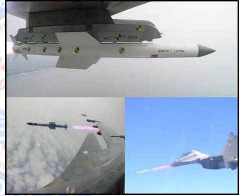
उत्तरी सीमा पर चीन के दुस्साहस को देखते हुए भारत जमीन और आसमान में अपनी स्थिति को मजबूत कर रहा है। असूत्र मिसाइल इसका ही एक जरिया है।