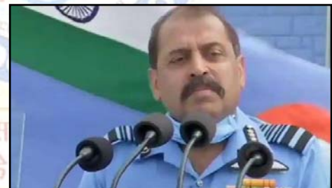
Air Chief Marshal RKS

A separate proposal to upgrade existing 59 MiG-29 aircraft has also been approved. The ministry has also approved procurement of 248 ASTRA beyond visual range (BVR) air-to-air