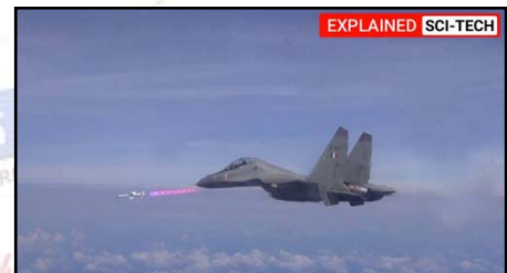
Astra Missiles, with Beyond Visual Range capability will serve as a force multiplier and immensely add to the strike capability of Navy and Air Force

Astra Missiles, with Beyond Visual Range capability will serve as a force multiplier and immensely add to the strike capability of Navy and Air Force, the government said on Thursday.