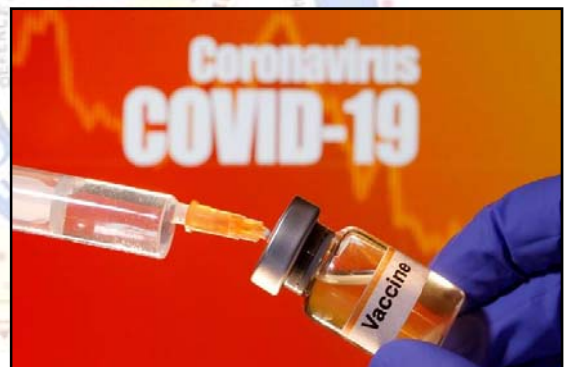
Coronavirus Covid-19 vaccine latest update, status, progress, human trials, latest news: Hyderabad-based Bharat Biotech has received approval from Drug Controller General of India (DGCI) to start phase I and II clinical trials.

India has joined the race to produce the Coronavirus COVID-19 vaccine and so far positive signs have emerged during the research process. Hyderabad-based Bharat Biotech has received approval from Drug Controller General of India (DGCI) to start phase I and II clinical trials. Bharat Biotech is producing the vaccine in collaboration with the Indian Council of Medical Research (ICMR) and the National Institute of Virology (NIV). As per reports, pre-clinical trials yielded positive results.