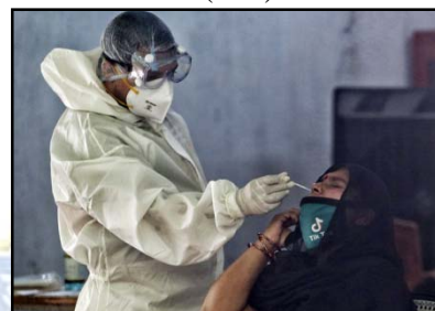
Health workers collecting swab samples for Covid-19 testing at a govt school in, New Delhi on Sunday.

https://www.business-standard.com/article/current-affairs/ahmedabad-co-enters-tech-transfer-pact-with-drdo-for-uv-disinfection-tower-120070201254_1.html