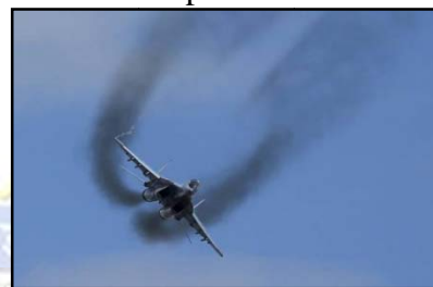
These two procurement proposals have been under consideration for almost two years now

According to an official announcement from the Ministry of Defence (MoD), "This approval has been given to increase the IAF's fighter squadrons." The MiG-29 from Russia, including the plans to upgrade the existing fleets of the MiG-29 in service is estimated to cost Rs 7418 crore. And the Su-30 MKI (which are being manufactured here as per Indian specifications) are going to be procured from state-owned Hindustan Aeronautics Limited (HAL) at an estimated cost of Rs 10,730 crore.