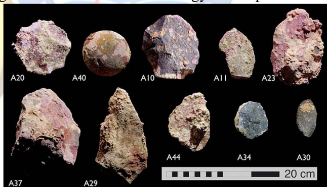
This undated handout picture shows underwater artefacts dated back thousands of years when the sea bed was dry land, found by researchers from Flinders University, University of Western Australia and James Cook University.