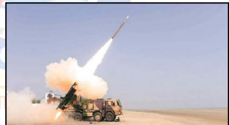
The Pinaka weapon system consists of Rocket, Multi Barrel Rocket launcher, Battery Command Post, Loader cum Replenishment Vehicle, Replenishment Vehicle and Digicora MET Radar