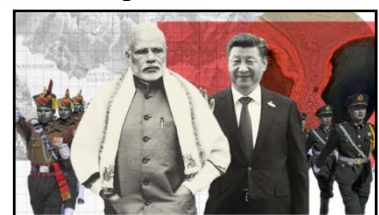
Representational image