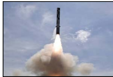
The BrahMos supersonic cruise missile

"DRDO and BrahMos Aerospace together have been pushing hard for exports of this missile to friendly foreign countries: for the last few months," sources said. The Indian government's defence export push is coming from the DRDO stable as it bagged orders for a 'made-in-India' weapon locating radars from the Armenian government recently.