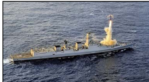
File photo of the BrahMos Supersonic Cruise Missile, as it is successfully test-fired from Indian Navy's Stealth Destroyer, INS Chennai

https://theprint.in/defence/indias-plans-to-export-brahmos-get-a-boost-as-philippines-sets-aside-funds-for-missiles/790913/