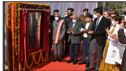
Haryana governor Bandaru Dattatraya inaugurating a 1,000 LMP PSA oxygen plant at Kalpana Chawla Government Medical College and Hospital in Karnal on Wednesday.

https://www.hindustantimes.com/cities/chandigarh-news/haryana-governor-inaugurates-oxygen-plant-at-karnal-s-kcgmc-101640806947115.html