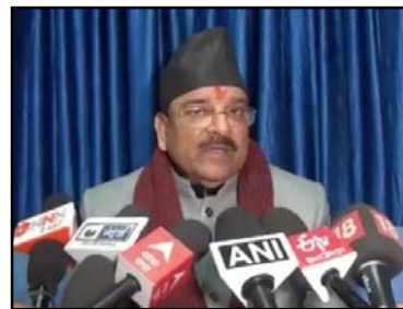
अजय भट्ट, केंद्रीय रक्षा राज्य मंत्री

सकते थे, सब्जियां नहीं भेज सकते थे। कई किस्म की अन्य चीजें नहीं भेज सकते थे। ये अपने उद्देश्य में सफल हुए हैं। सबसे बड़ी बात ये है कि भारत के पूर्व राष्ट्रपति अब्दुल कलाम भी यहां आए। उन्होंने कहा कि कुछ ऐसा काम करिये, कुछ ऐसी दवा बनाएं जो किसी ने नहीं बनाई। ल्यूकोडर्मा सफेद दाग की जो दवा यहां बनाई गई।