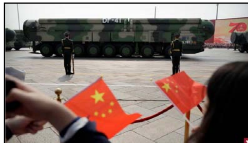
Spectators wave Chinese flags as military vehicles carrying DF-41 ballistic missiles roll during a parade to commemorate the 70th anniversary of the founding of Communist China in Beijing, Oct. 1, 2019. China’s military buildup has triggered unease across Asia and was the driving factor behind the recent formation of a three-way U.S., Britain and Australia security pact focused on the region, according to President Biden’s top national security adviser for the Indo-Pacific. ** FILE **

The report, which was published in the official military newspaper PLA Daily, also asserted that China is merging four major technology fields for military purposes: nano, bio, information and cognition.