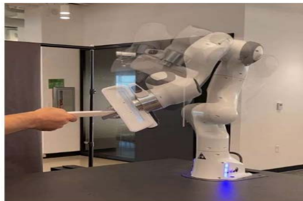
The researchers propose a human-robot handover system that uses ...