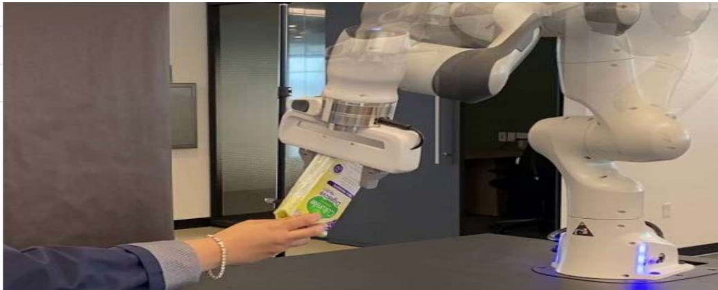
The researchers propose a human-robot handover system that uses ...