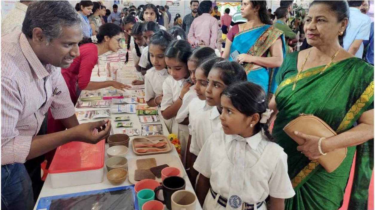
Schoolchildren at the exhibition organised at the Defence Food Research Laboratory (DFRL) in Mysuru on Saturday on the occasion of Open Day.

Students thronged the Defence Food Research Laboratory (DFRL), a constituent lab of the Defence Research and Development Organisation (DRDO), Ministry of Defence, Government of India, on Saturday as it hosted an Open Day where its technologies developed over the last few years were showcased.