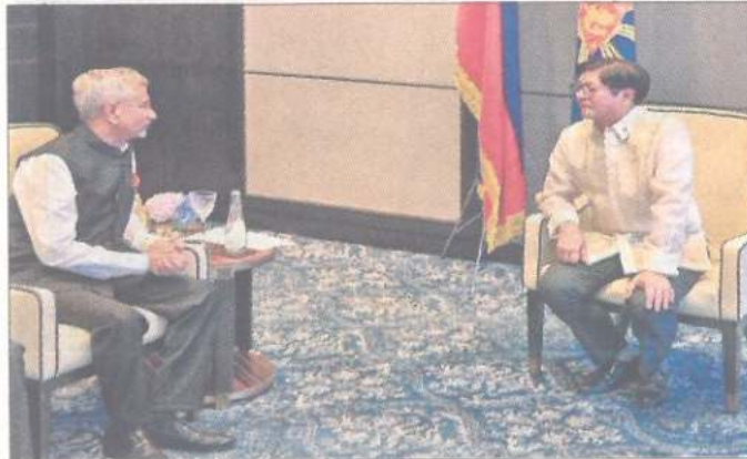
External Affairs Minister S Jaishankar with Philippines President Ferdinand Romualdez Marcos Jr during a meeting in New Delhi.