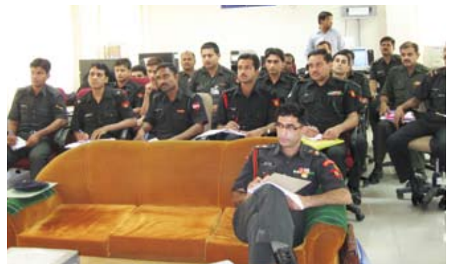
Participants at the ASTROIDS II Application Software Training