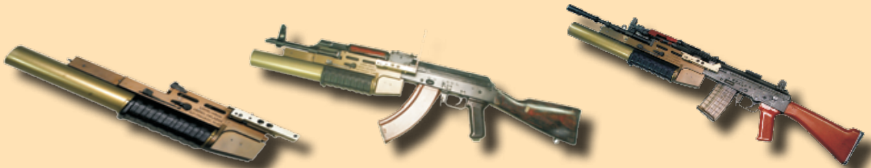
40 mm UBGL

The Army has accorded Bulk Production Clearance (BPC) to the 40 mm Under Barrel Grenade Launcher (UBGL). UBGL is designed and developed by the Armament Research and Development Establishment (ARDE), Pune, and manufactured at Ordnance Factory, Trichy.