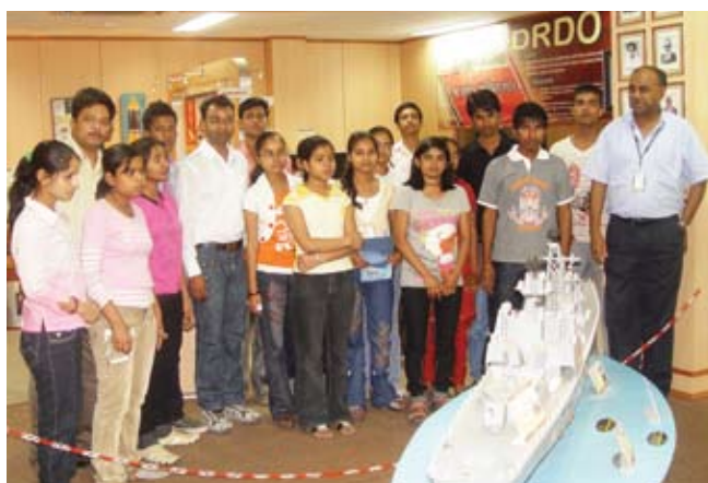
Students from Vidhya and Child showing keen interest at Darpan

More than 25 visiting students (class 9 onwards) were exposed to the various science and technology achievements of DRDO. The students interacted with the Director and others at RAC, and were overwhelmed by their unique exposure to the defence setup. They showed keen interest in the exhibition.