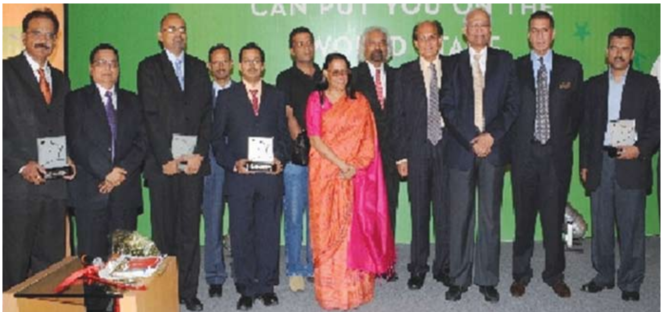
Winners of the 'Innovation for India Awards 2010' at the Award Ceremony at Grand Hyatt, Mumbai