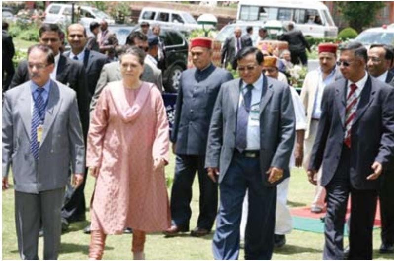
Ms Sonia Gandhi, Chairperson, National Advisory Council along with Hon'ble Raksha Mantri Shri AK Antony, Hon'ble Chief Minister, Shri PK Dhumal, Himachal Pradesh, and other dignitaries going for plantation of trees on SASE campus

Ms Sonia Gandhi, Chairperson of the National Advisory Council, in the presence of Hon'ble Raksha Mantri, Shri AK Antony. The prestigious Rohtang tunnel is a key step forward to make the Leh–Manali highway an all-weather passage to the strategic Ladakh