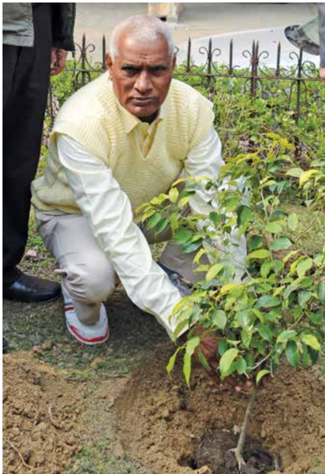
Shri Bishambar Singh planting tree

Environmental pollution is a matter of serious concern not only for the Government but also for the citizens of the country and specially for the denizens of Delhi. One of the easiest ways to check the menace of pollution