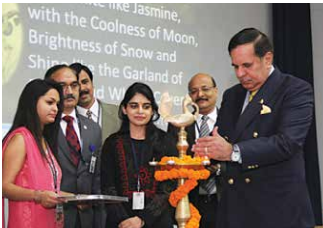
Lt Gen AB Shivane inaugurating NVET-2015

Four specialized lectures were delivered by the experts in the areas of Thermal Imaging, Image Intensifier Tubes, Lasers, and Stabilization and Fire Control Systems. Delegates were showcased the state-of-the-art products for search, surveillance and tracking of enemy targets for various platforms. The workshop brought out the achievements and future roadmap in the field of Night Vision Empowering Technologies for India