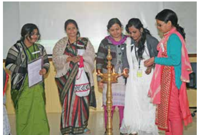
Inauguration of the workshop by the participants