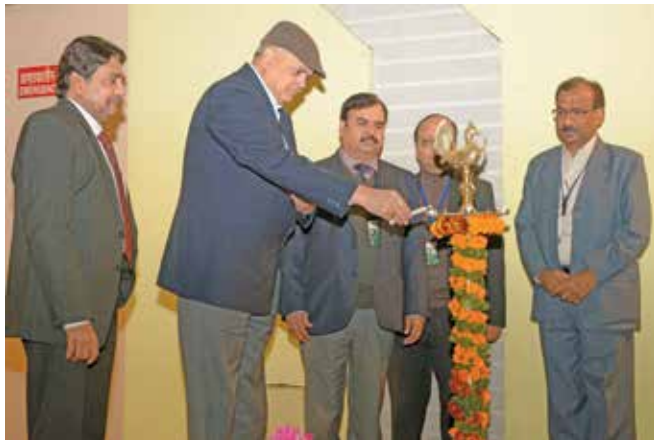
Inaugural of S&T Hindi Conference organised by DEAL