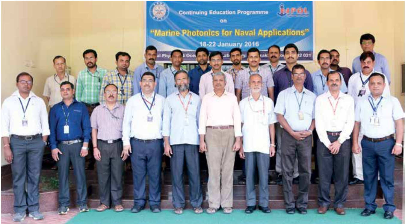
Participants of the course on Marine Photonics for Naval Applications

communication and fiber optic hydrophones were arranged for the participants to provide more exposure. The faculty consisted of scientists from NPOL, LASTEC, SSPL, LRDE, IRDE and Professors from IISc, Bangalore, Cochin University of Science and Technology (CUSAT), Indian Institute of Space Science and Technology (IIST), Thiruvananthapuram and industry experts from SFO Technologies, NEST Group, Cochin.