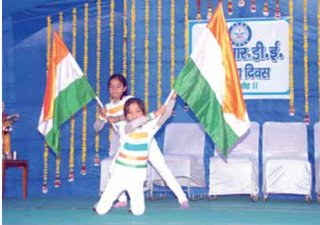
Kids performing on ADRDE Annual Day