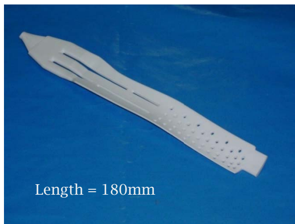
Fig. 3: Shrouded low pressure turbine blade (LPTB) core.